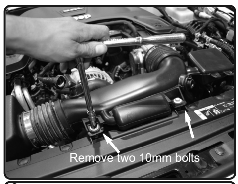
3. Loosen the 2 bolts holding in the intake tube and remove. .