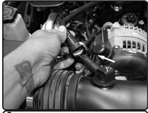
6. Disconnect the crank case line from the intake tube.