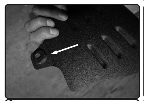
9. From step 4, install the grommet with crush washer to the hole on the airbox bracket.