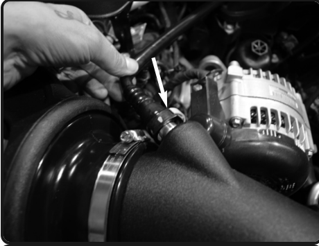
15. Connect the crank case vent tube to the machined fitting on the intake tube.