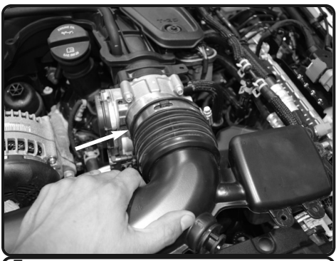
5. Loosen the clamp on the throttle body and pull back the intake tube from the throttle body.