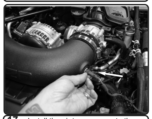
17. Install the air temp sensor to the rubber grommet on intake tube and reconnect the harness.