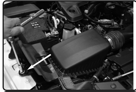
4. On the air box, loosen the bolt holding in the airbox. Loosen bolt and save for later install along with the grommet and crush washer.