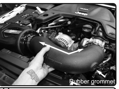
14. Install the provided rubber grommmet to the intake tube hole. Insert the Injen intake tube into the vehicle. Position tube to the filter and throttle body. Postion for best fit.