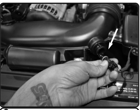
2. Carefully disconnect the temperature sensor, pull back the harness from the intake tube.