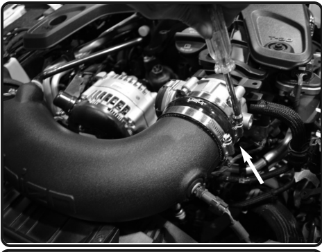
16. Secure and tighten all the clamps on the intake tube using 8mm nut driver.