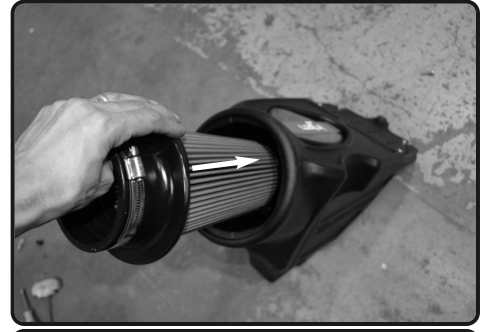
11. Install the twist lock filter into the airbox and secure.