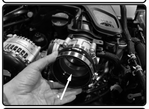
8. Install the provided step hump hose to the throttle body. Secure using provided clamps.