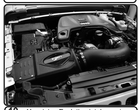
19. Your injen Evolution intake system is now complete.

Congratulations! You have just completed the installation of this intake system. Periodically, check the alignment of the intake, normal wear and tear can cause nuts and bolts to come loose. Note: Check clearance and adjust if needed! Failure to check the alignment and adjust the intake can cause damage that will void the warranty. Injen Technology is not responsible for any damages caused by/from improper installation.