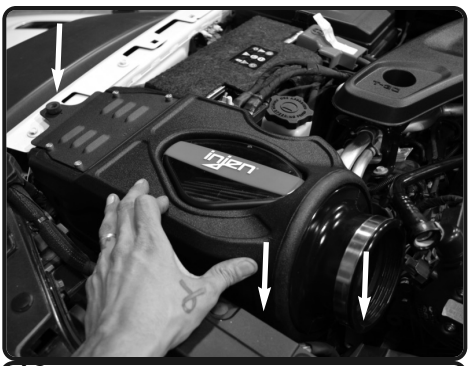
13. Install the airbox assembly into the vehicle. install into the factory position. Secure using the OEM screw from step