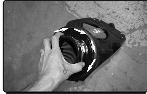
12. Once the twist lock filter is seated properly, rotate the filter in either direction a 1/4" turn untill filter locks into place.