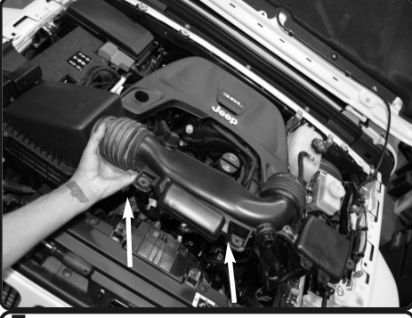
7. Remove the stock intake system out of the vehicle.