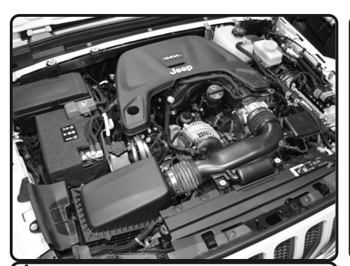
1. Stock intake system shown.