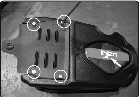
10. Secure the bracket to the air box using M6 socket cap screws. Secure and tighten using allen key.