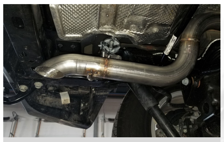
Detail 15b: Dump tip installed