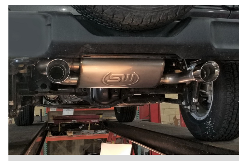
Detail 15a: Muffler and tips installed

After double checking for clearance and making sure all lines, wires, and hoses are secured, drive the car for 10-20 miles and re-check all clamps and clearances. Your system can be tack welded at the joints/clamps to reduce shifting of the system during heating and cooling cycles. Be sure to disconnect the battery before performing any welding.