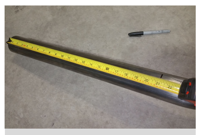
Detail 10a: 2 Doors only. Mark and cut 21" from mid pipe inlet.