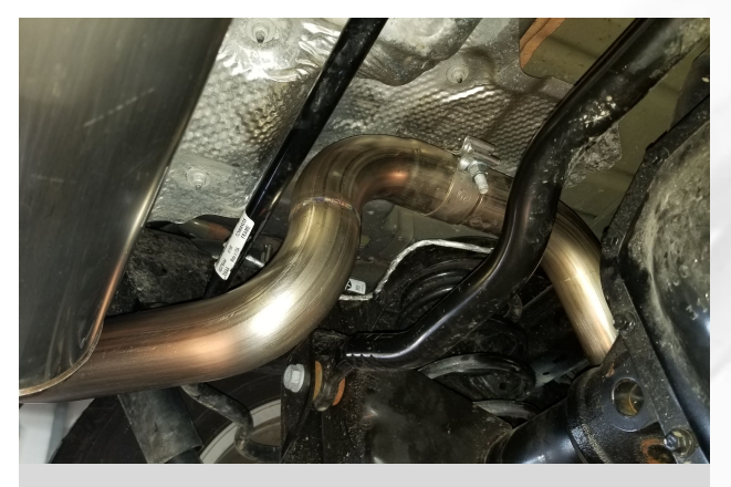
Detail 12: Muffler connection.