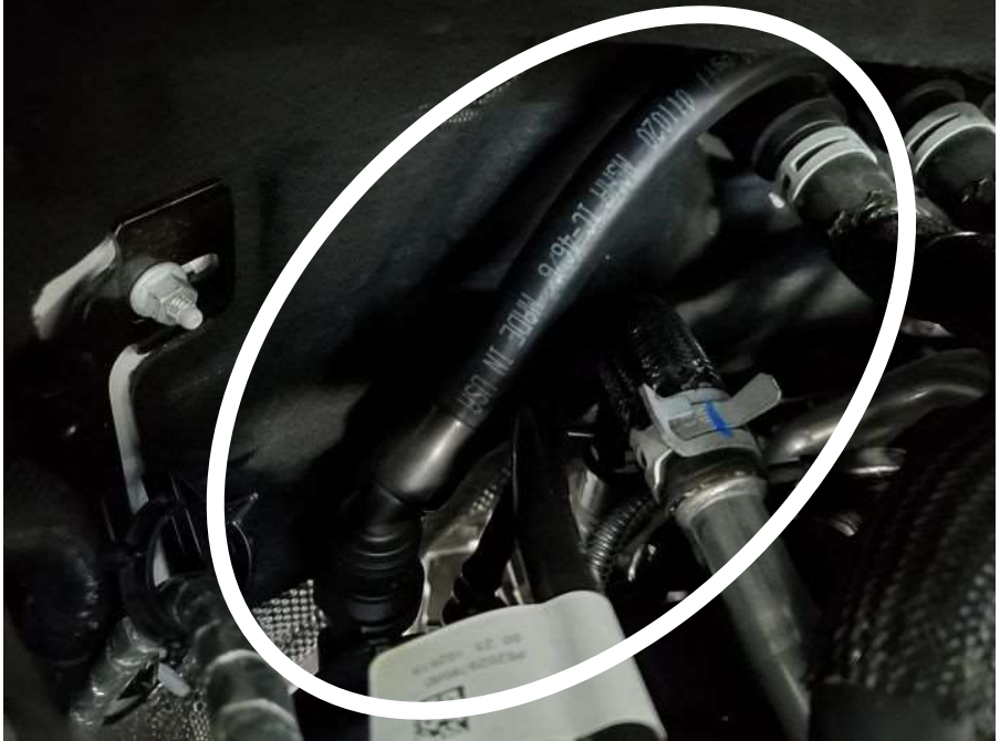
Plug long hose on to the PCV connection on the back of valve cover